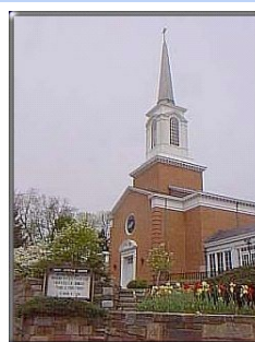
A faith community welcoming all to a place where you can connect with God and people -- offering service to others as a sign of God's love.

Christ Lutheran Church 8011 Old Georgetown Road Bethesda, Maryland 301-652-5160